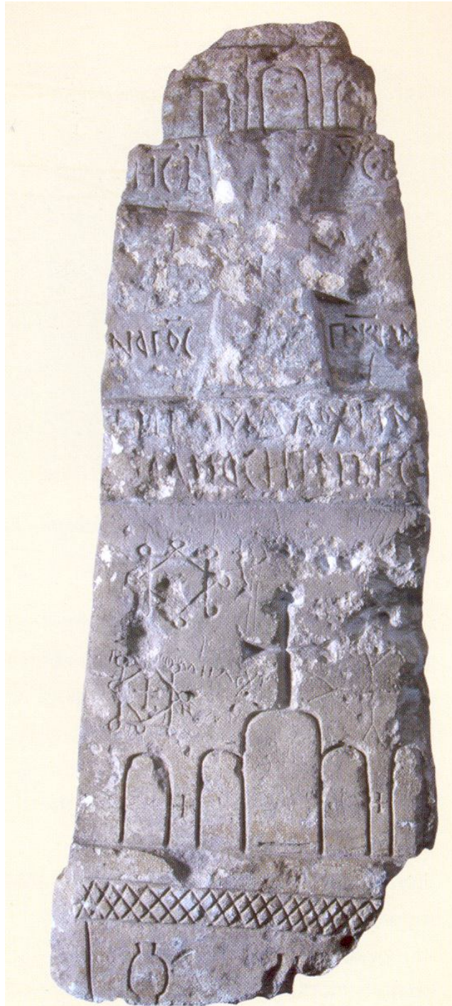
Votive stone with an inscription in both Cyrillic and Glagolitic. Tsar Assen, Silistra region. Late 9 th – early 10 th c.