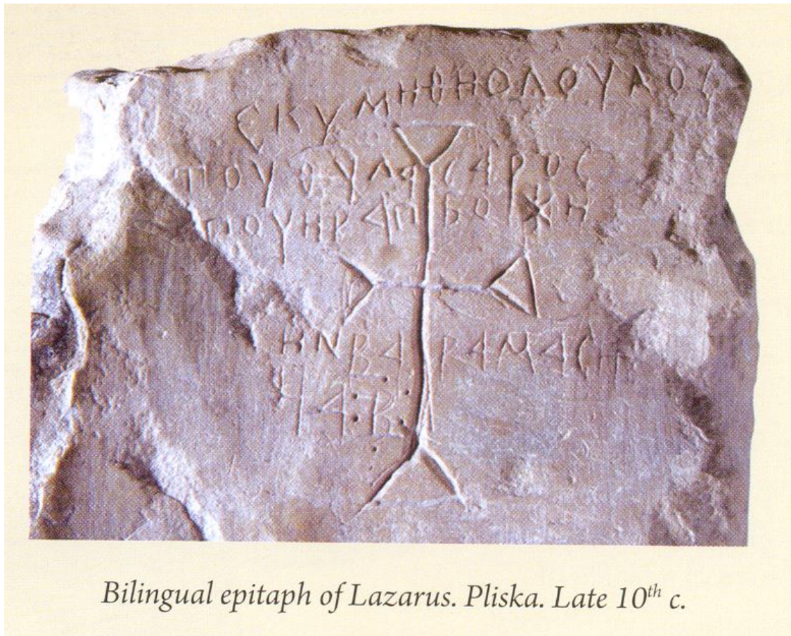
Bilingual epitaph of Lazarus. Pliska. Late 10 th c.